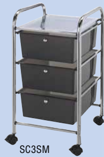
SC3SM (all deep)

Patented interlocking rail and drawer system prevents shifting off the rails