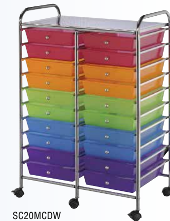
SC20MCDW (all standard)