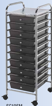
SC10SM (all standard)