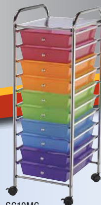
SC10MC (all standard)