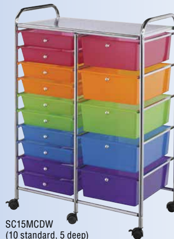
SC15MCDW (10 standard, 5 deep)