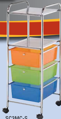
SC3MC-S (all deep)