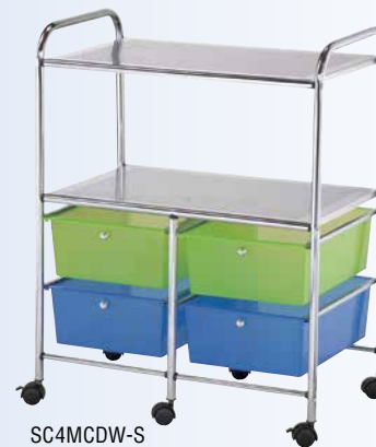
SC4MCDW-S (4 deep)