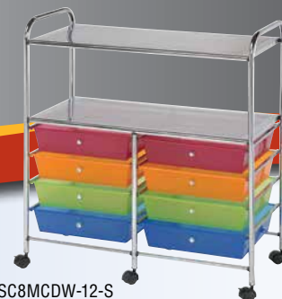
SC8MCDW-12-S (all wide)