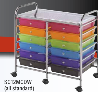
SC12MCDW (all standard)