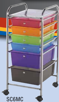
SC6MC (4 standard, 2 deep)