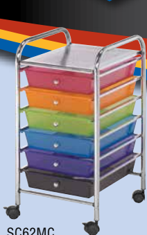
SC62MC (all standard)