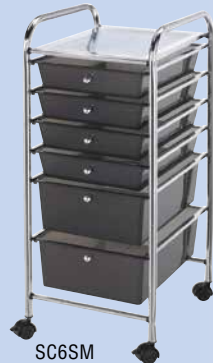
SC6SM (4 standard, 2 deep)