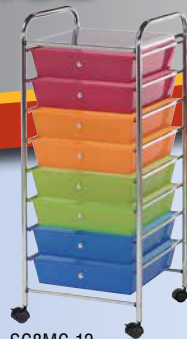
SC8MC-12 (all wide)