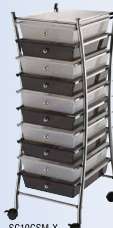
SC10CSM-X (all standard)